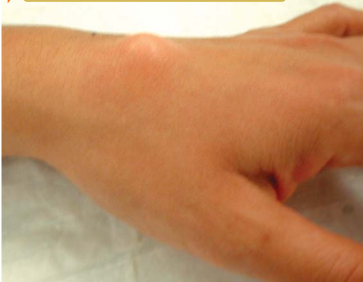
Figure 1: Ganglion top side (dorsum) wrist